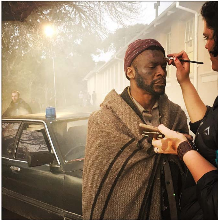
"On set at 'Five Fingers for Marseilles', an original South African Western"

"America in Africa, Africa in America: Ties that Bind or Blind"